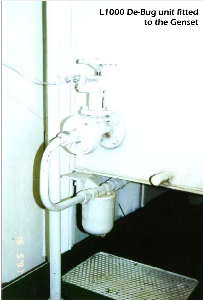
L1000 De-Bug unit fitted to the Genset