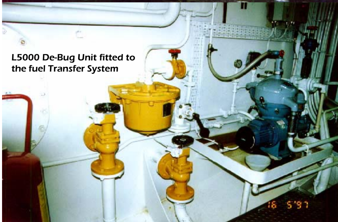
L5000 De-Bug Unit fitted to the fuel Transfer System