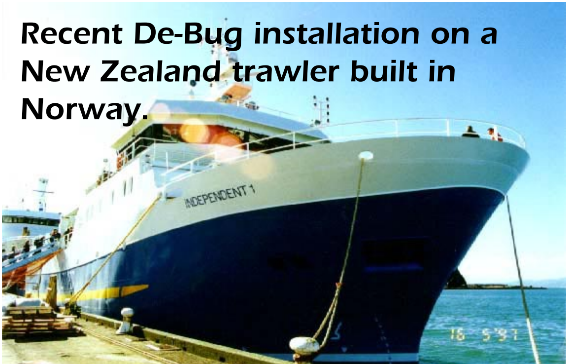
Independent 1 - Independent Fisheries Ltd. Lyttleton, New Zealand